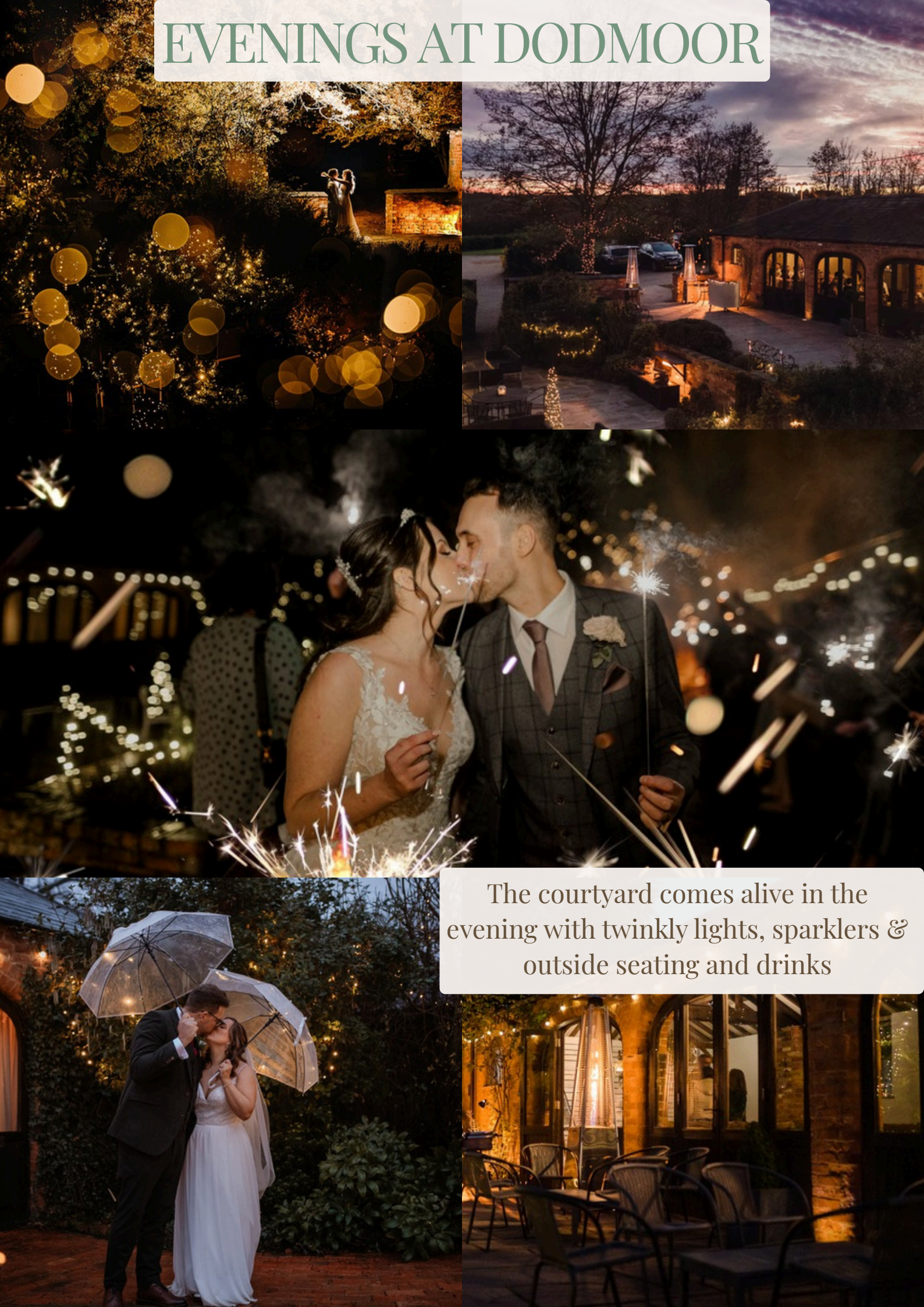
The courtyard comes alive in the evening with twinkly lights, sparklers & outside seating and drinks